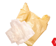
NO Loose Plastic Bags, Bagged Recyclables or Film Empty recyclables directly into your bin.