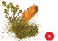
NO Green Waste